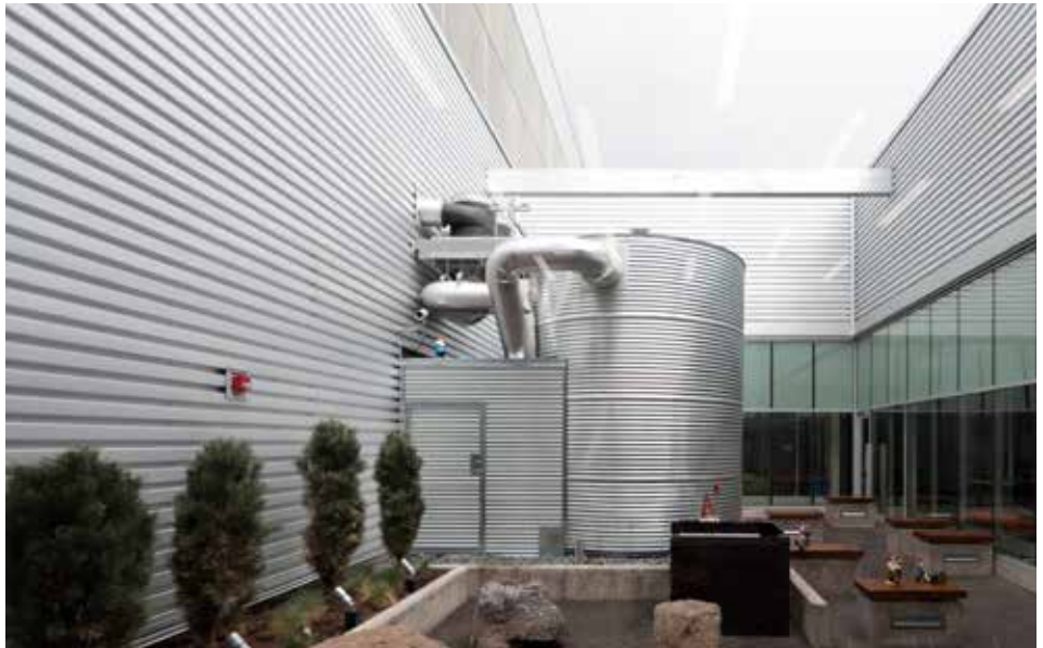
Facebook Data Center, Prineville, OR

ASTM A 792, AZ50 or AZ55 coating designation, structural quality, Grade 50 or Grade 33, 0.0236-inch (0.60-mm), 0.0296-inch (0.75-mm), 0.0356 inch (0.904 mm) or 0.0466 inch (1.184 mm) minimum thickness.