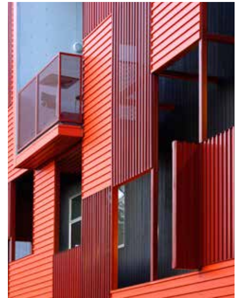
Formosa 1140, West Hollywood, CA