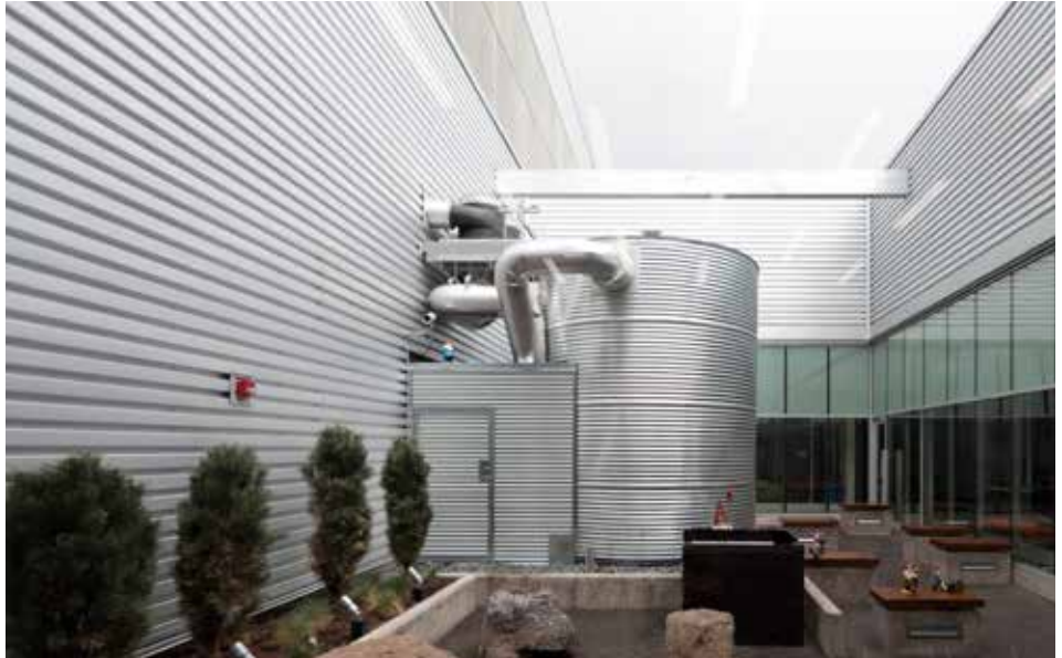
Facebook Data Center, Prineville, OR

ASTM A 792, AZ50 or AZ55 coating designation, structural quality, Grade 50 or Grade 33, 0.0236-inch (0.60-mm), 0.0296-inch (0.75-mm), 0.0356 inch (0.904 mm) or 0.0466 inch (1.184 mm) minimum thickness.