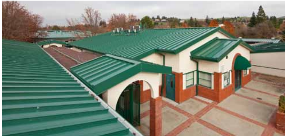
Charlotte Wood Middle School, Danville, CA