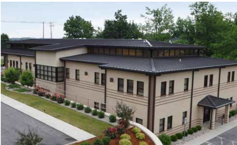
Medical Office, Elizabethtown, KY