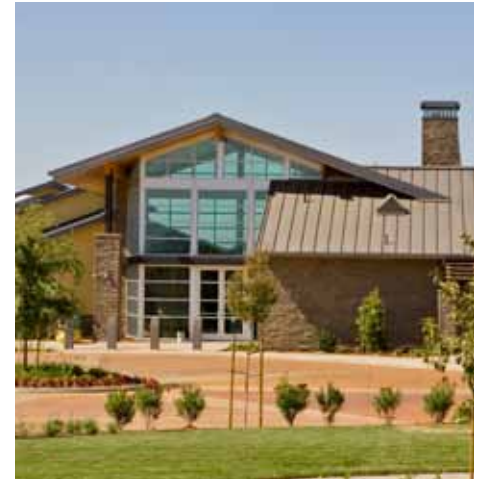
Club Lincoln Crossing, Lincoln, CA