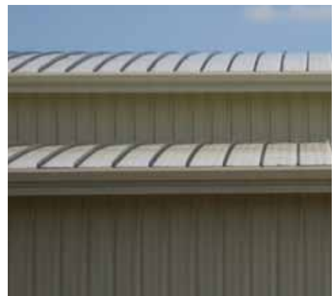
Visitor Center, Tuscon, AZ