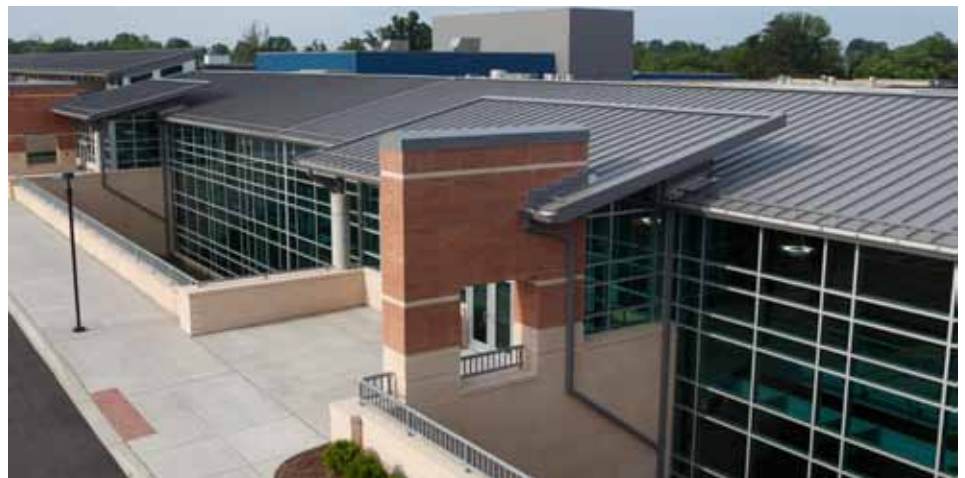
Charlestown High School, Charlestown, IN

After installation remove temporary coverings and protection of adjacent work areas. Repair or replace any installed products that have been damaged. Clean installed panels in accordance with manufacturer's instructions prior to Owner's acceptance.