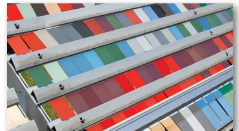
Test fences hold metal panels at a 45-degree angle in south Florida for maximum exposure.

Chemical Resistance – No significant color change after 24 hours exposure to 10% solutions of hydrochloric and sulfuric acids, per ASTM D 1308, Procedure 7.2, after 2000 hour weatherometer test.