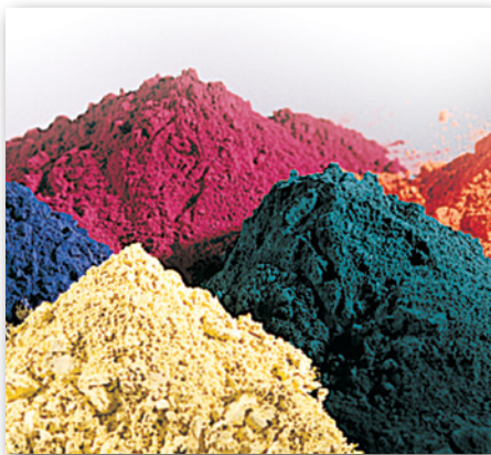
High-quality inorganic and ceramic pigments.

MS Colorfast45 uses a combination of select inorganic and ceramic pigments for coloring. These pigments offer years of exceptional performance in harsh weather and resist color change, acids, alkalis and oxidizing agents found in harsh environments.